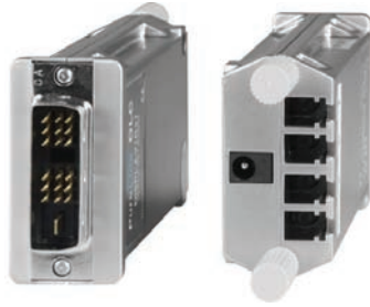
ST-FODVI-LC Receiver* (Front & Back) *The transmitter looks the same as the receiver

Extend a single link digital DVI display up to 4,920 Feet