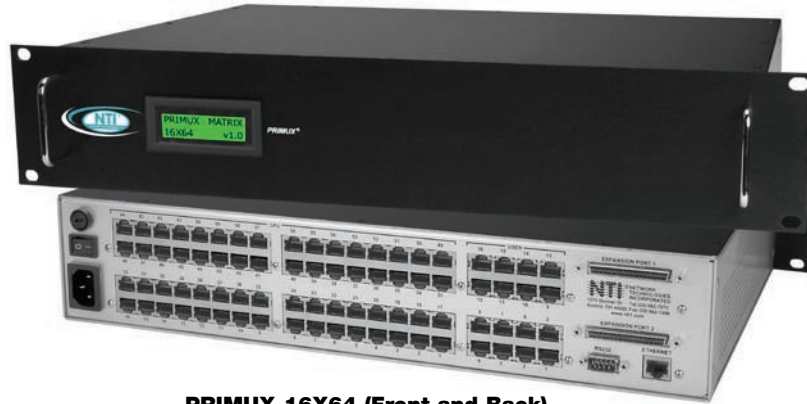
PRIMUX-16X64 (Front and Back)

Consolidated control for multi-user, multi-rack server environment up to 305 meters away