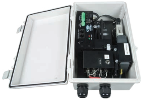
The Outdoor Environment Monitoring System box opened